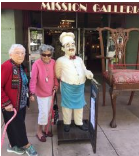
Shopping at the Antique store in Downtown Riverside