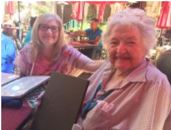
Mother and Daughter lunch date at the Mission Inn restaurant.