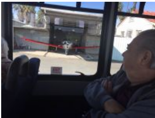
Scenic Drive at the old Riverside airport.