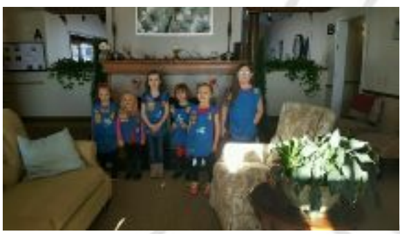
THANK YOU TO THE DIXON GIRL SCOUT TROOP #2189 FOR STOPPING BY AND VISITING WITH US. THEY HANDED OUT VERY SPECIAL VALENTINE'S CARDS. WE HOPE TO SEE YOU ALL SOON